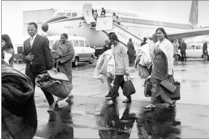
[Ugandan Asians escaping persecution arriving in Britain in 1972]

Use Sources A, B and C to identify one similarity and one difference about immigration to Britain over time. [4]